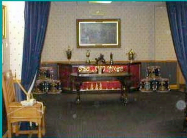
WO & Sgts Mess Lobby.