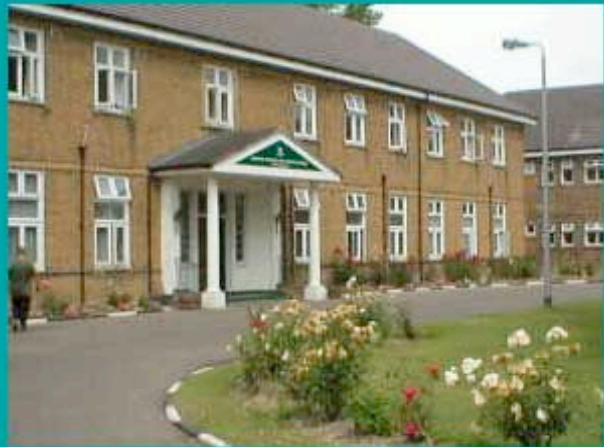
Warrant Officer's and Sergeant's Mess.

The Warrant Officer's and Sergeant's Mess has one family room. All of the other rooms are for single soldiers, but consist of two rooms. Prices start from £1 per night for army personnel, and £10 a night for non-army personnel.