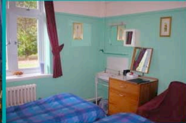
A Typical Guest Room in the WO & Sgts Mess.