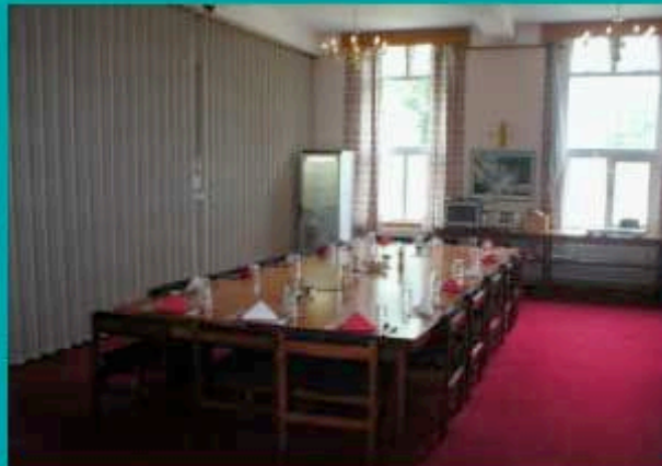
WO & Sgts Mess Living Area.