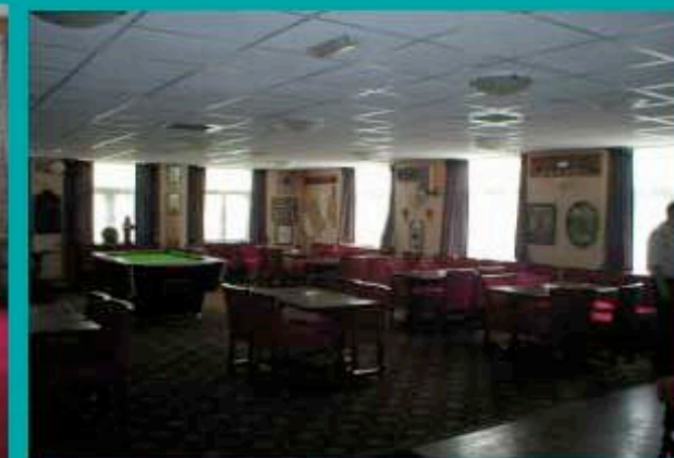
WO & Sgts Mess Bar.